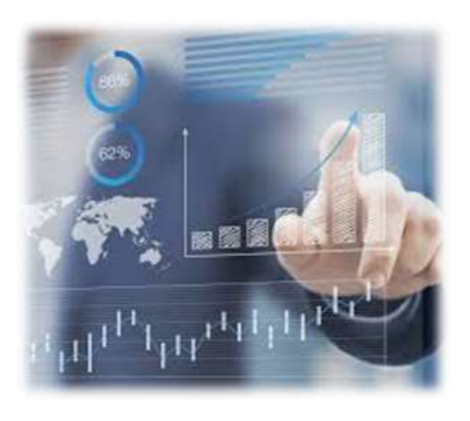
The Right Route for High Business Performance